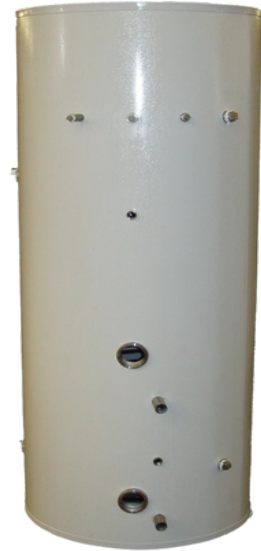
2000 Series Solar Water Heaters