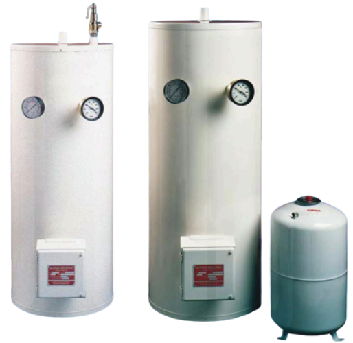
2000 Series Storage Water Heaters