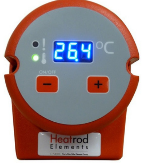
HRD Digital Immersion Heater

The HRD range is designed to be heavy duty with flexibility in mind, for easy installation into multiple industrial liquid heating applications. The terminal box is proven for ease of wiring and flexible for access in all types of locations. The digital controller can be programmed and wired for both single or three phase operation. Along with the standard Incoloy sheath, we also manufacture using different levels of element sheath protection depending on the environment which the heater is being installed into.