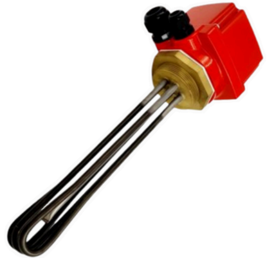
HRI Heavy Duty Immersion Heater

* also available for chemical and oil applications (please contact us for recommendations)