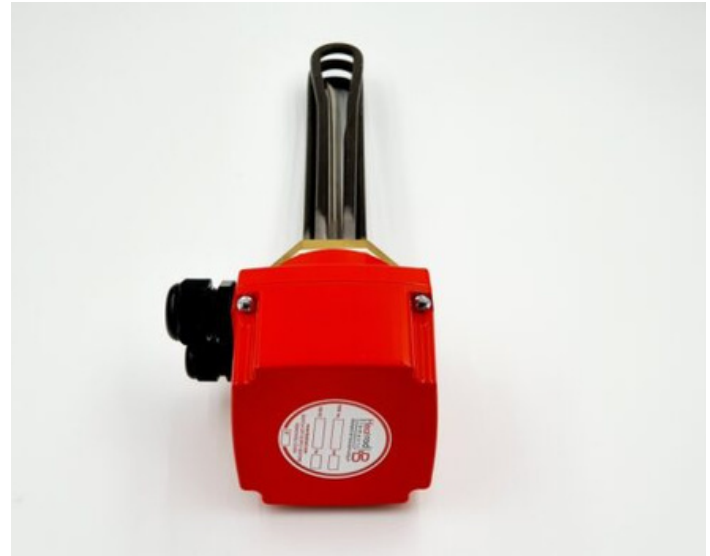
HRZi Heavy Duty Industrial Titanium Immersion Heater